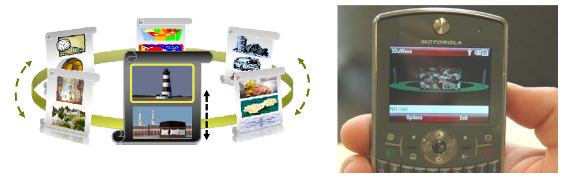
Figure 6: Mobile 3D User Interface with uWave-based gesture interaction: (left) Illustration of the user interface and (right) prototype implementation

user authentication and the other for gesture-based interaction with mobile phones.